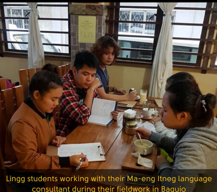
Lingg students working with their Ma-eng Itneg language consultant during their fieldwork in Baguio

Nonetheless, all Lingg majors are required to learn at least one foreign language. Learning foreign languages allows students to gain deeper insights into their own native languages as they learn the languages and cultures of others . Doing so also develops their cognitive skills, as well as their cultural sensitivity and awareness.