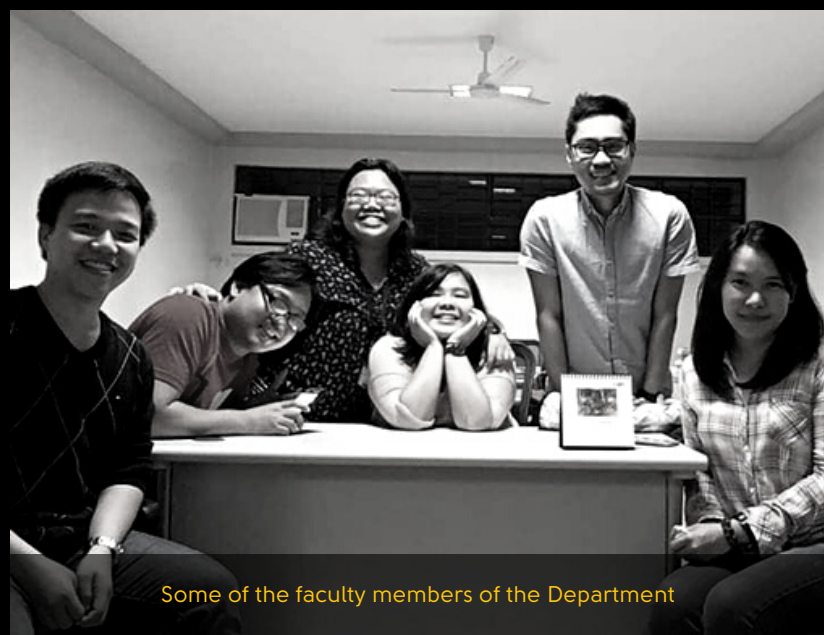
Some of the faculty members of the Department