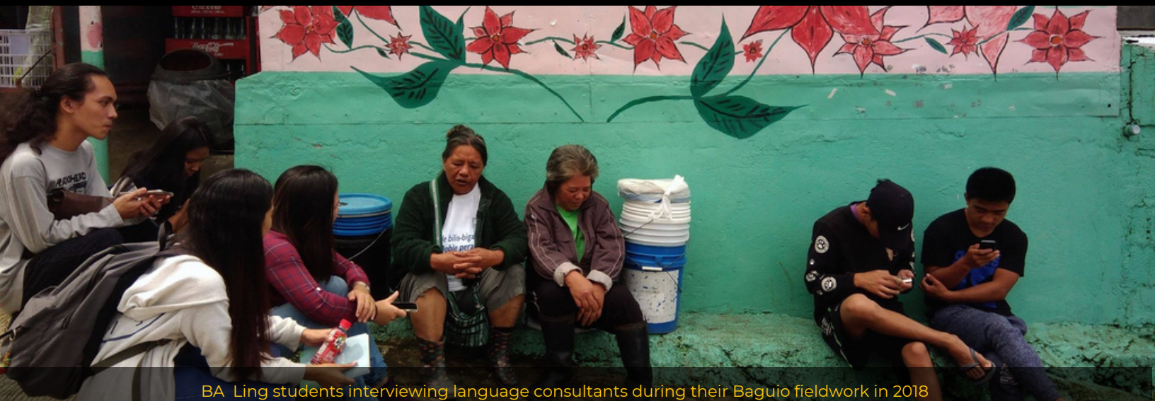
BA Ling students interviewing language consultants during their Baguio fieldwork in 2018