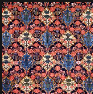
Persian / Farsi